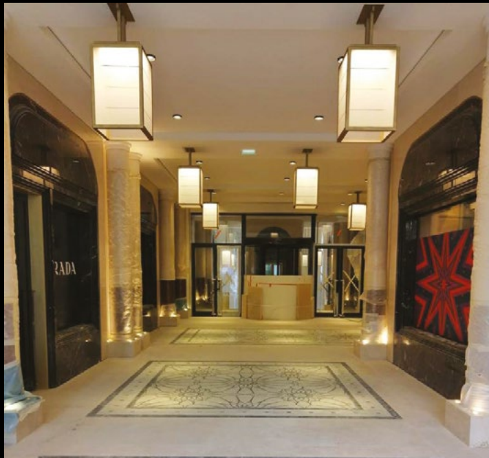
HÔTEL DE PARIS – MONTE CARLO