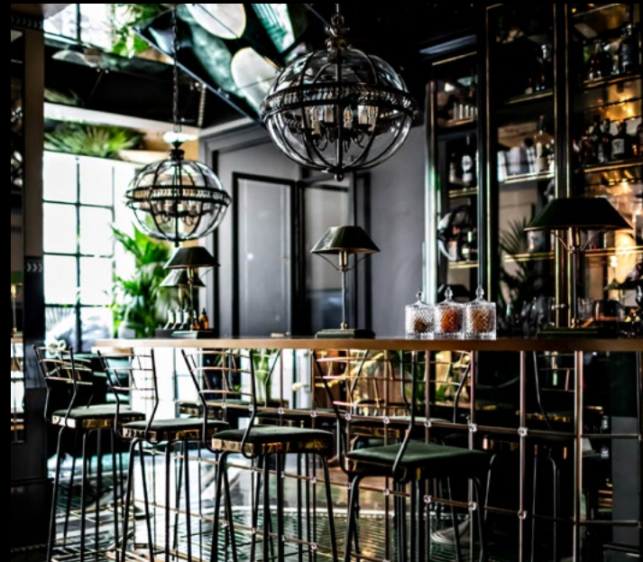
MONSIEUR GEORGE HOTEL & SPA – PARIGI