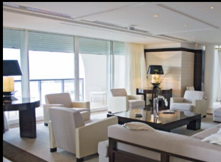
HOTEL BARRIÈRE LE MAJESTIC – CANNES