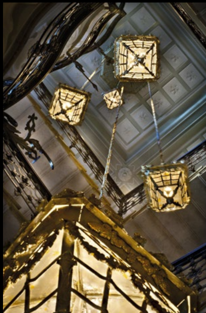
CHÂTEAU MONFORT – MILANO