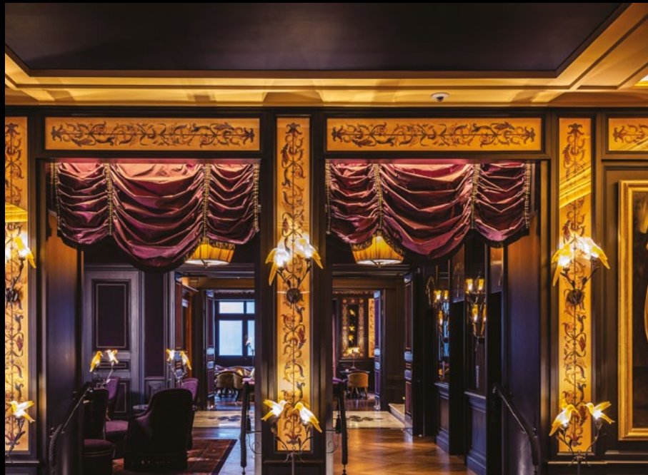
OSCAR HOTEL – LONDRA