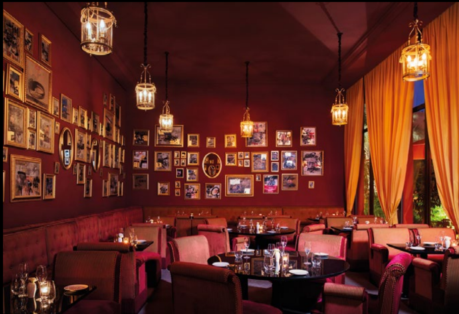
THE PEARL HOTEL – MARRAKECH