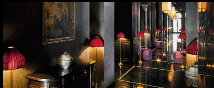
SELMAN HOTEL – MARRAKECH