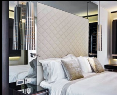
EXCELSIOR HOTEL GALLIA – MILANO