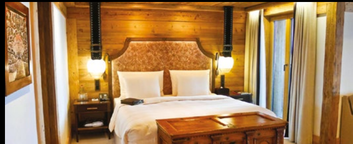
GRAND HOTEL THE ALPINA – GSTAAD