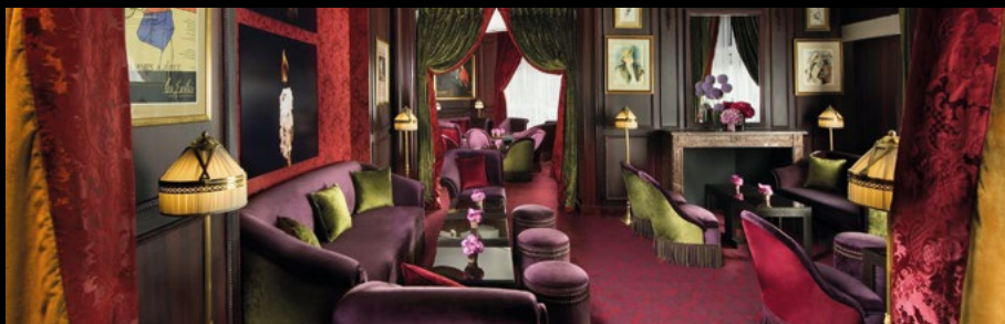
HOTEL BARRIÈRE LE FOUQUET'S – PARIGI