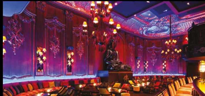
BUDDHA BAR – MONTE CARLO