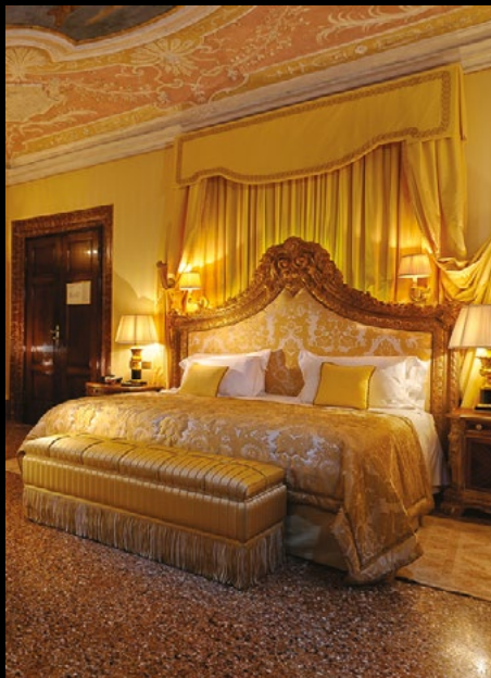
HOTEL DANIELI – VENEZIA